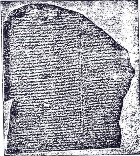
The Rosetta Stone

Space would not permit quoting a large number of other prophecies just as specific as the ones we have considered, and just as convincing. The pages of Holy Writ abounds in daring forecasts concerning Jerusalem, Judca, the twelve tribes of Israel, Samaria, Philistia, Moab, Gaza, Chaldea, Syria, Nineveh, Medo-Persia, Greece, etc. Many of these prophecies have already been fulfilled, while others are in the process of being fulfilled.